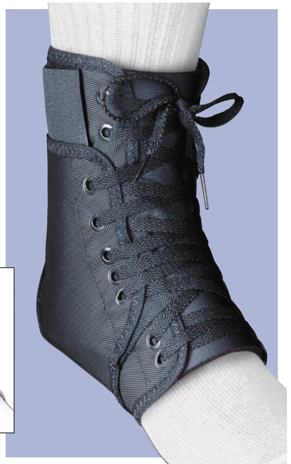
Internal Figure-Eight Strapping

Manufactured for FLA Orthopedics® by Swede-O®. Ideal for sports and to support weak or injured ankles. Made of lightweight, low-profile nylon material for long-lasting wear. Extra ankle stabilization with internal figure eight straps that are preconfigured to ensure correct placement every time. Application is quick and easy. Comfortably fits in athletic shoes. Elastic back. Fits left or right. Color: Black.