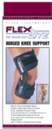
FlexLite® Hinged Knee Support

Measure around leg 4" above center of kneecap.