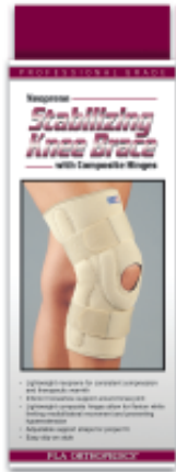
Neoprene Stabilizing Knee Brace with Composite Hinges