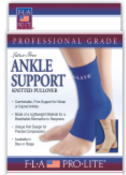
ProLite® Ankle Support Knitted Pullover

Model: 40-400 Color: Beige, Blue HCPCS: L1901