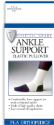
Ankle Support Elastic Pullover

Add measurement around ankle to measurement around foot at arch.