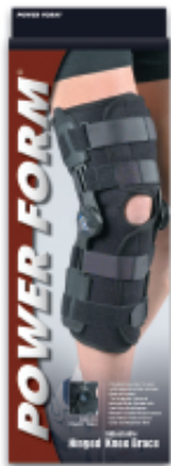
PowerForm™ Adjustable Hinged Knee Brace

Measure around leg 4" above center of kneecap for thigh and 4" below center of kneecap for calf.