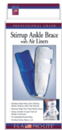
ProLite® Stirrup Ankle Brace with Air Liners

Model: 40-908 Color: White/Blue HCPCS: L4350