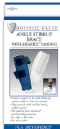
Ankle Stirrup Brace with Sheartex® Padding