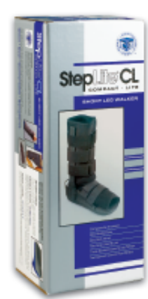
StepLite® CL Compact Lite Short Leg Ankle Walker

Model: 43-316 Colors: Black HCPCS: L4386