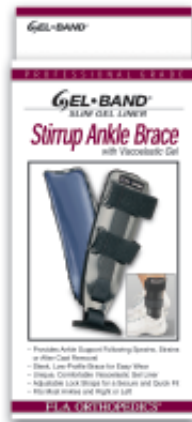
GelBand® Slim Gel Liner Stirrup Ankle Brace