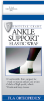
Figure Eight Elastic Ankle Wrap

Universal Up to 27" Measure around thigh.