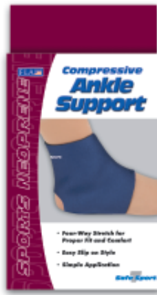
Safe-T-Sport® Neoprene Ankle Support

Measure around ankle just above ankle bone.