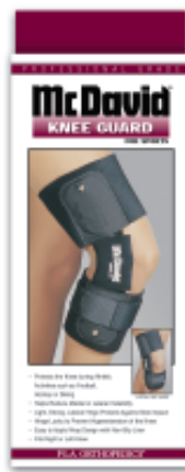
McDavid™ Knee Guard

Measure around leg 4" above center of kneecap for thigh and 4" below center of kneecap for calf.