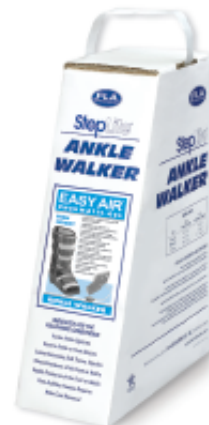
StepLite® Easy Air™ Pneumatic-Gel Ankle Walker

Model: 43-440 Low 43-450 High Colors: Black/Gray HCPCS: L4360