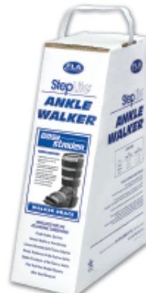
StepLite® Easy Strider™ Ankle Walker

Size according to US shoe size. US Patent D515,217