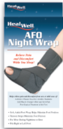
HealWell® AFO Night Wrap

Size according to US shoe size. Specify Right or left. US Patents D481,798; D495,058 & D497,207