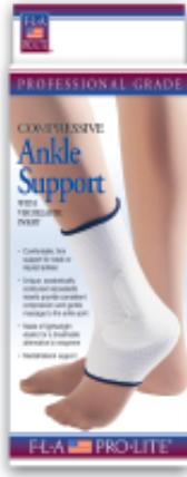
ProLite® Compressive Ankle Support