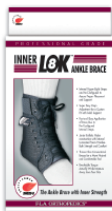
Swede-O® Inner Lok 8™ Ankle Brace