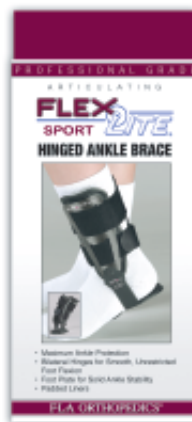
FlexLite® Sport Articulating Hinged Ankle Brace