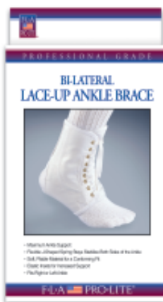
ProLite® Bi-Lateral Lace-Up Ankle Brace