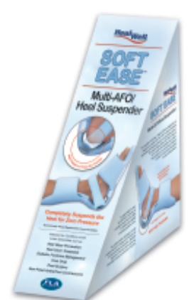
HealWell® Soft Ease™ Multi-AFO Heel Suspender

Measure around ankle. Specify Right or Left. US Patent D436,177