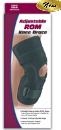
Adjustable ROM Knee Brace

Universal Under 6' Tall Over 6' Size according to height.