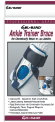
GelBand® Ankle Trainer Brace

Model: 40-850/851 Color: White/Navy HCPCS: L4350