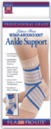
ProLite® Wrap-Around Knit Ankle Support

Model: 40-500 Colors: Beige, Blue HCPCS: L1901