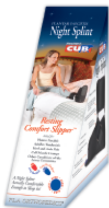
HealWell® Cub™ Plantar Fasciitis Night Splint Resting Comfort Slipper™

Model: 58-500 Right 58-501 Left Colors: Black HCPCS: L4396