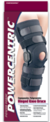
PowerCentric™ Composite Polycentric Knee Brace