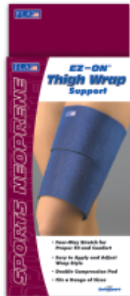
EZ-ON® Thigh Wrap Support

Measure around leg 4" above center of kneecap for thigh and 4" below center of kneecap for calf. US Patent 5,244,455