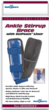
GelFoam™ Ankle Stirrup Brace