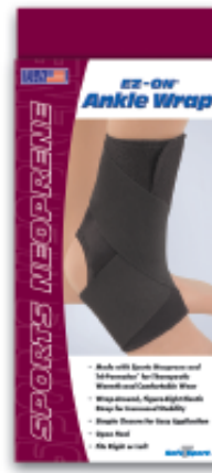
Safe-T-Sport® EZ-ON® Wrap-Around Ankle Support