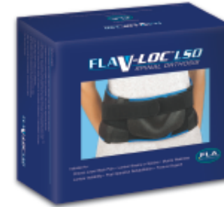
FLA V-LOC™ LSO Spinal Orthosis

Measure around fullest part of the abdomen. US Patent D499,806