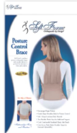
Soft Form® Posture Control Brace

Measure around chest at base of sternum.