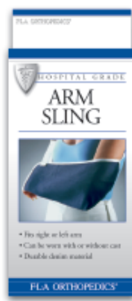
Denim Cradle Arm Sling

Measure forearm from elbow to base of little finger.