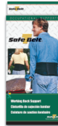
Safe-T-Belt® Working Back Support

Measure around hips just below waistline.