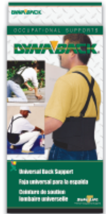
DynaBack® Universal Back Support

Model: 70-160 Color: Black Size: XS-XXL HCPCS: L1499