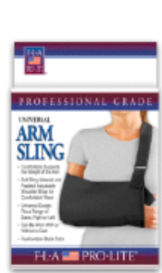
ProLite® Universal Arm Sling