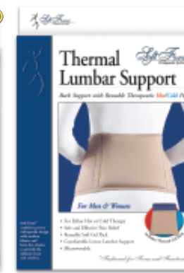
Soft Form® Thermal Lumbar Support

Measure around waist at navel. US Patents 5,207,636; 5,267,948