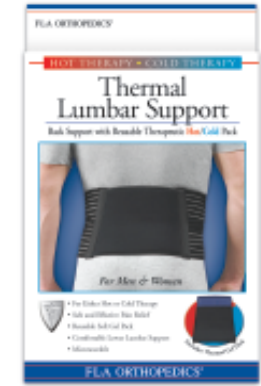
Thermal Lumbar Support

Measure around fullest part of abdomen. US Patent D496,108