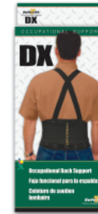
Safe-T-Lift® DX Occupational Back Support

Model: 70-110 Color: Black Size: XS-XXXL HCPCS: L1499