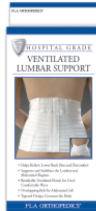
Ventilated Lumbar Support

Measure around fullest part of the abdomen. Model 31-550 has Flexible stays; 31-560 has Contoured stays.