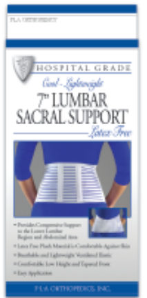
Cool-Lightweight 7™ Lumbar Sacral Support

Measure around fullest part of abdomen. US Patent D496,108