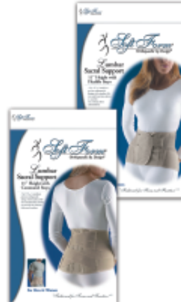
Soft Form® Lumbar Sacral Support, 11"

Measure around hips just below waistline.