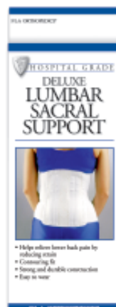
Deluxe Lumbar Sacral Support, 11"