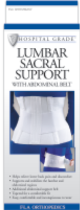
Lumbar Sacral Support with Abdominal Belt, 10"

Measure around hips just below waistline.