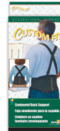
Custom Fit® Contoured Back Support

Model: 70-120 Color: Black Size: XS-XXL HCPCS: L1499