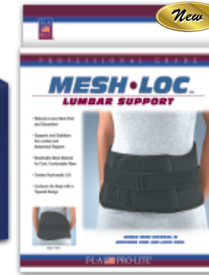
ProLite® Mesh-Loc™ Lumbar Support

Measure around waist at navel. US Patents 5,207,636; 5,267,948