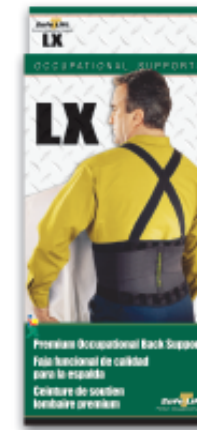
Safe-T-Lift® LX Premium Occupational Back Support

Model: 70-910 Color: Black Size: XS-XXL HCPCS: L1499