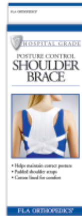
Posture Control Shoulder Brace

Measure forearm from elbow to base of little finger.