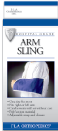
Cradle Arm Sling