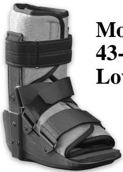
Model No: 43-420 Low Height