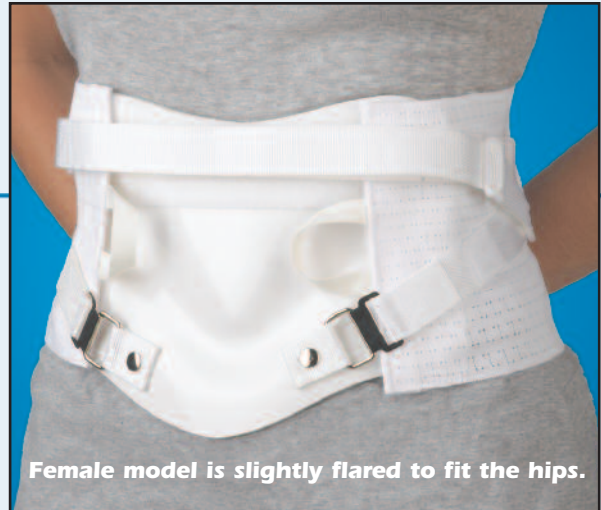
Female model is slightly flared to fit the hips.

During the initial critical pain phase, the SystemLOC's rigid anterior should be used. During the secondary phase, the pain should lessen and the patient can become more mobile. The SystemLOC's semi-rigid anterior can be worn with complete comfort at all times — while working, participating in normal activities, and during rehabilitation programs. Due to its patented closure system, the SystemLOC™ will provide constant abdominal support as well as protection for the healing back.